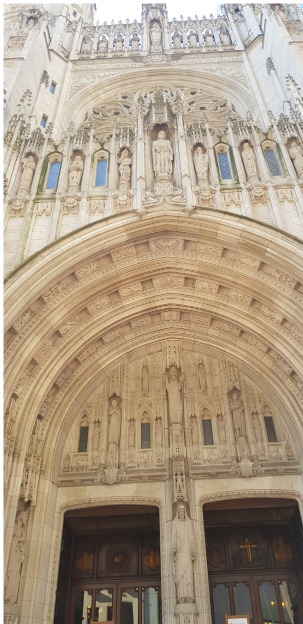
Saint Thomas's Fifth Avenue