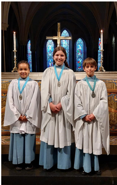
Deputy Head Girls & Boy