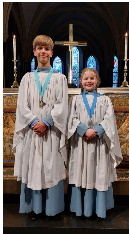
Head Girl & Boy