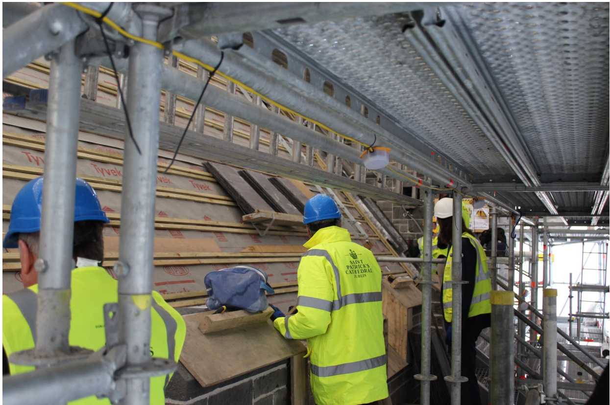
An under-the-cover view.

Editorial & Circulation The Deanery Office, Kevin Street Upper Dublin, D08 AW65 Telephone: 453 9472