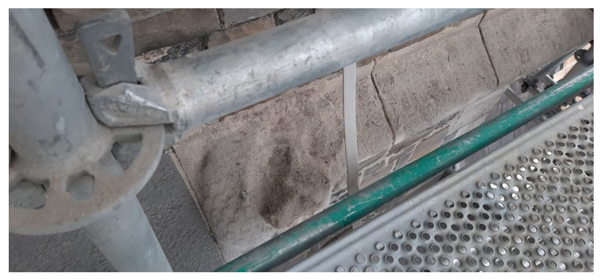
Can you see the dog in the parapet?