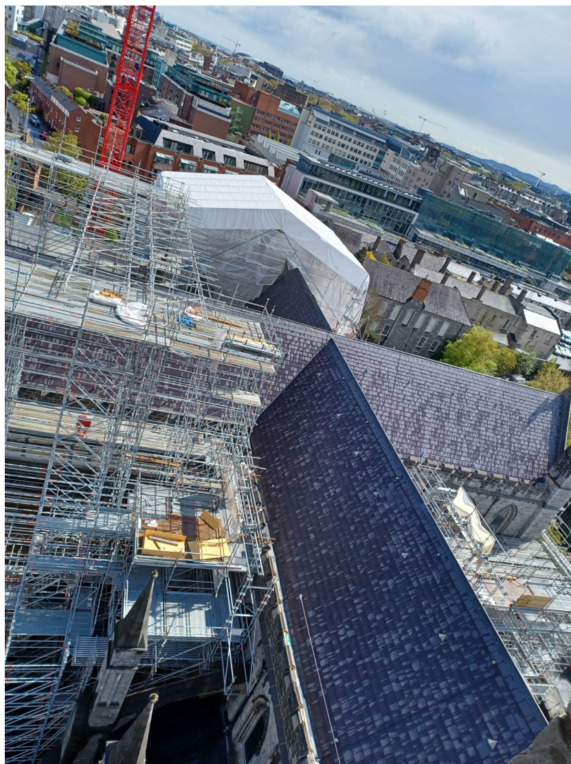
A view from the Minot Tower

Editorial & Circulation The Deanery Office, Kevin Street Upper Dublin, D08 AW65 Telephone: 453 9472