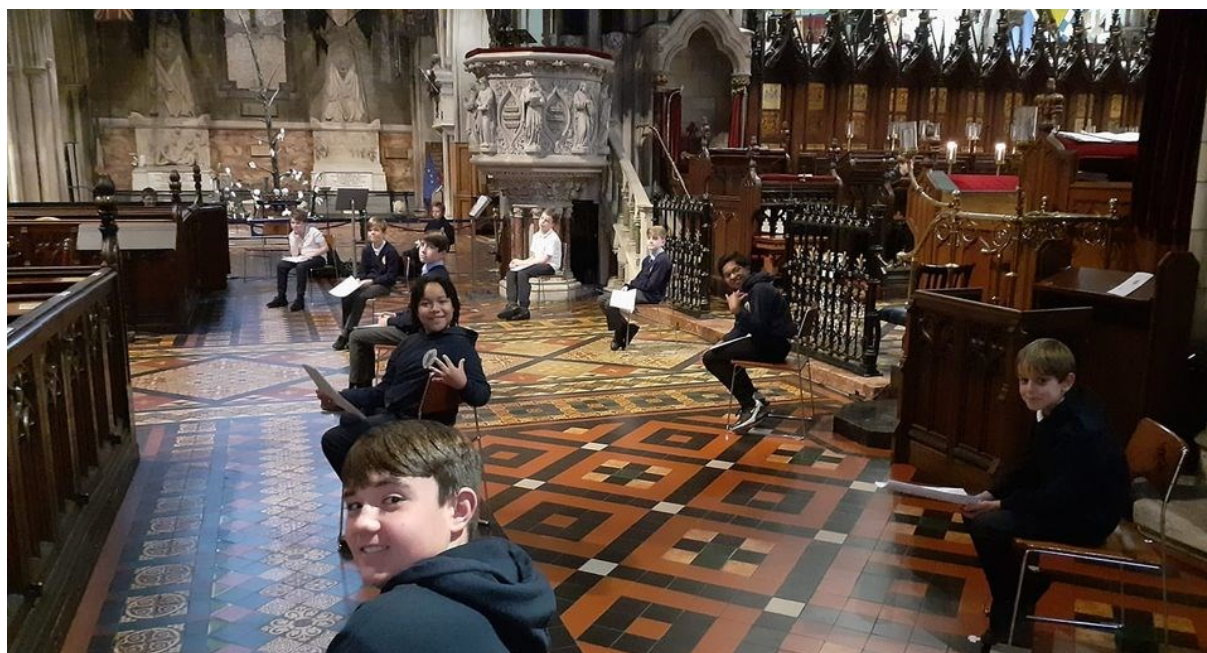
The Choristers rehearsing for Matins

www.stpatrickscathedral.ie/worship/video-stream .