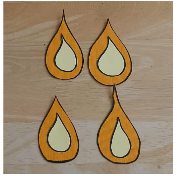
Step 5: Glue the yellow pieces into to the orange pieces.