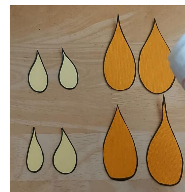
Step 4. Cut out your little flames.