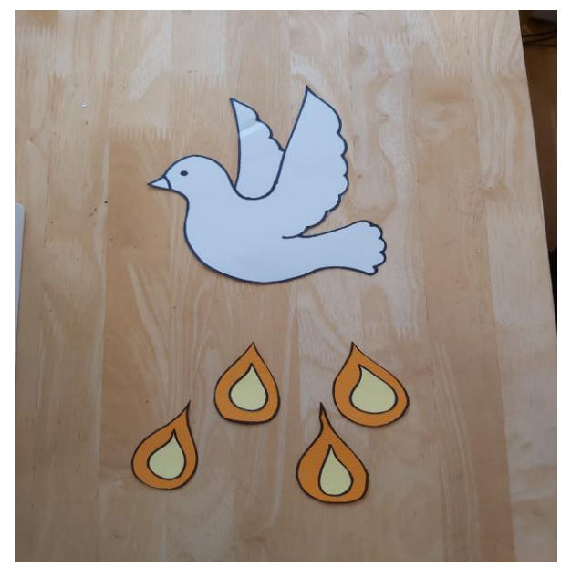
Step 7. Your All Done!!!