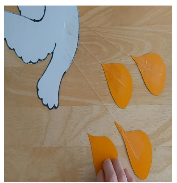
Step 6. Selotape the flames to strings and stick them to the Dove. Remember to stick them to the back of the Dove.