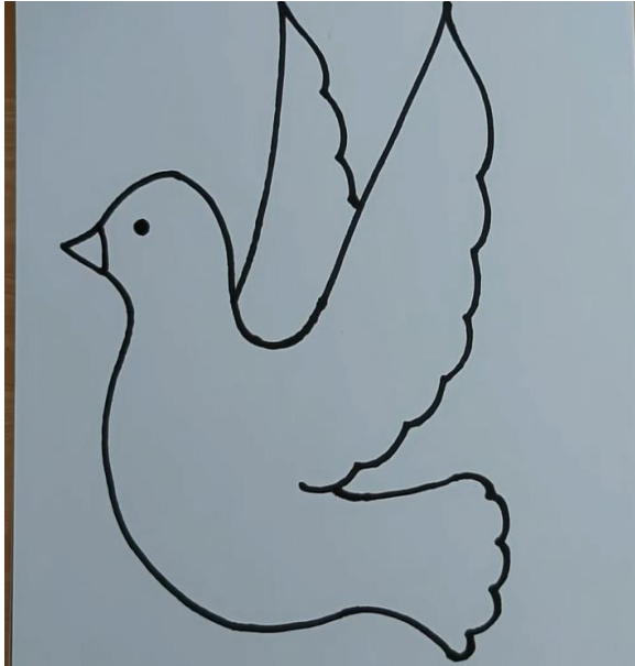
Step 1. Draw the outline of a dove. We have an online version you can print out as well.