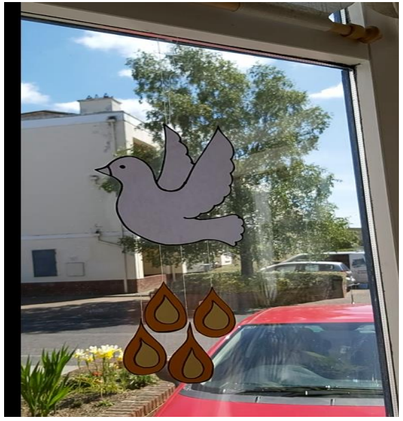
Step 8. Your Dove will look lovely in a window!