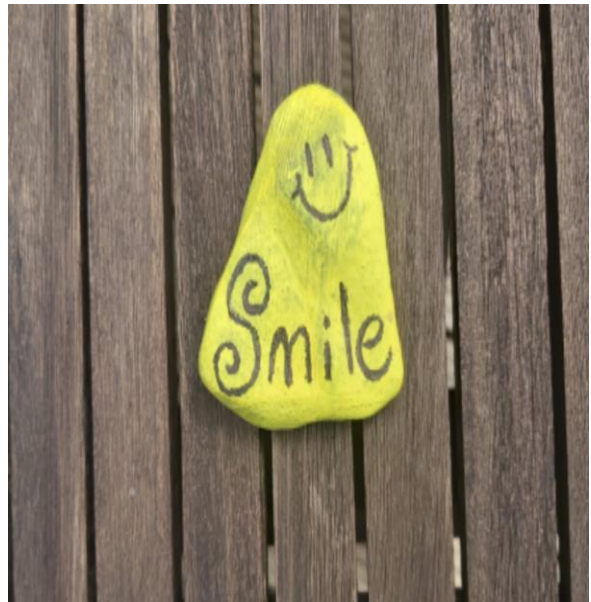
Step 4: All Done!!