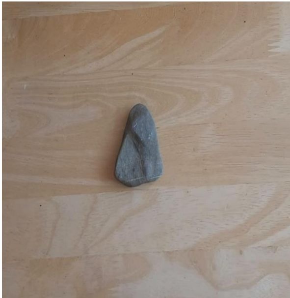
Step 1. Find a stone