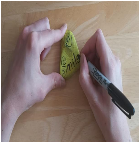
Step 3. Wait for the paint to dry then Write your message