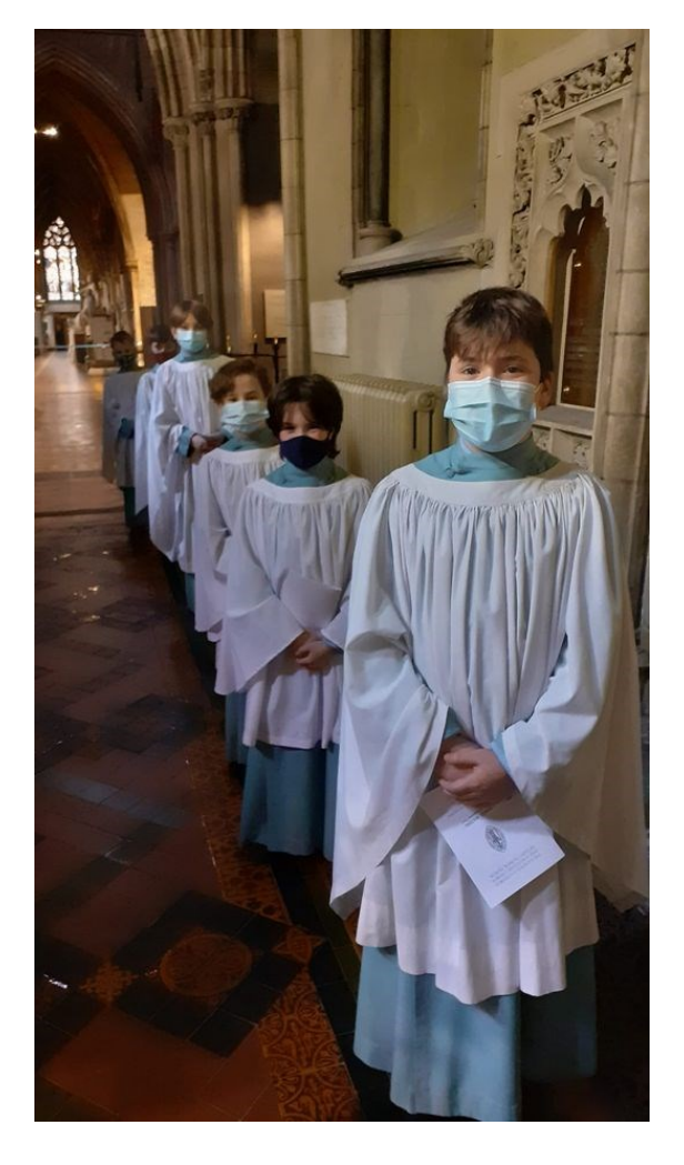
Choristers waiting to be admitted into the Choir

Editorial & Circulation The Deanery Office, Kevin Street Upper Dublin, D08 AW65 Telephone: 453 9472