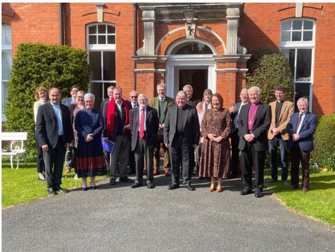
Members of the Cathedral Board & Chapter