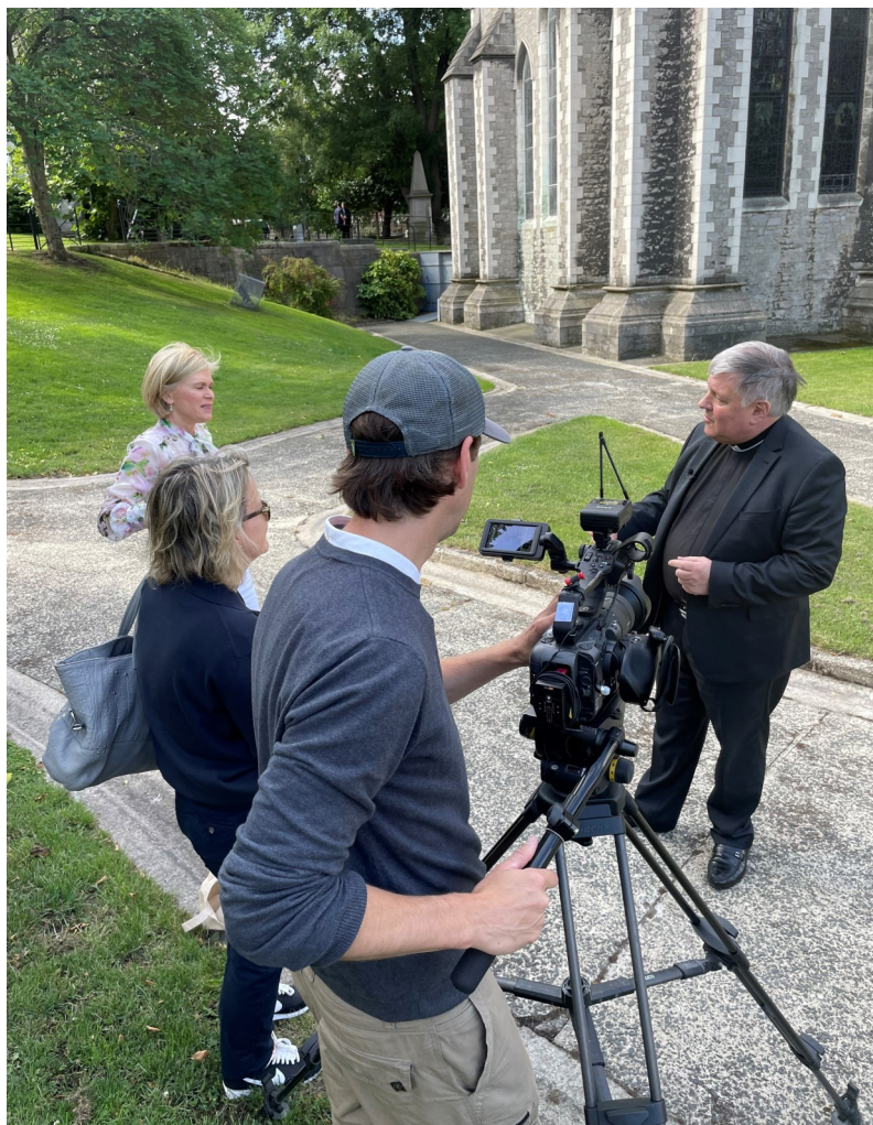
The Dean being interviewed by members of the RTÉ crew

The provisional transmission date is Wednesday 26th July at 19:00 on RTÉ One.