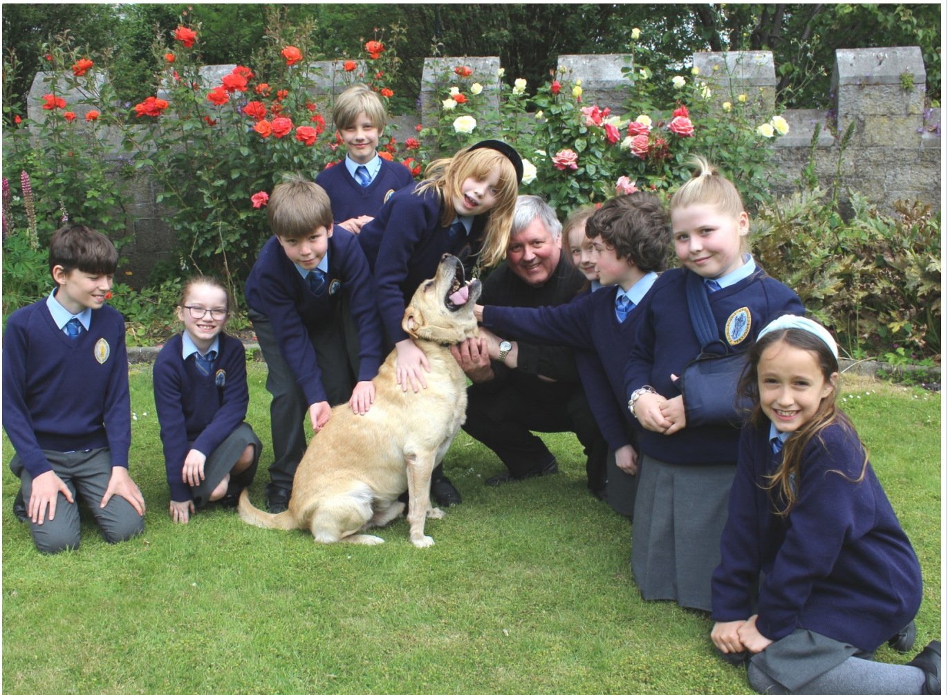
Pupils of the Choir School with The Dean & Duke