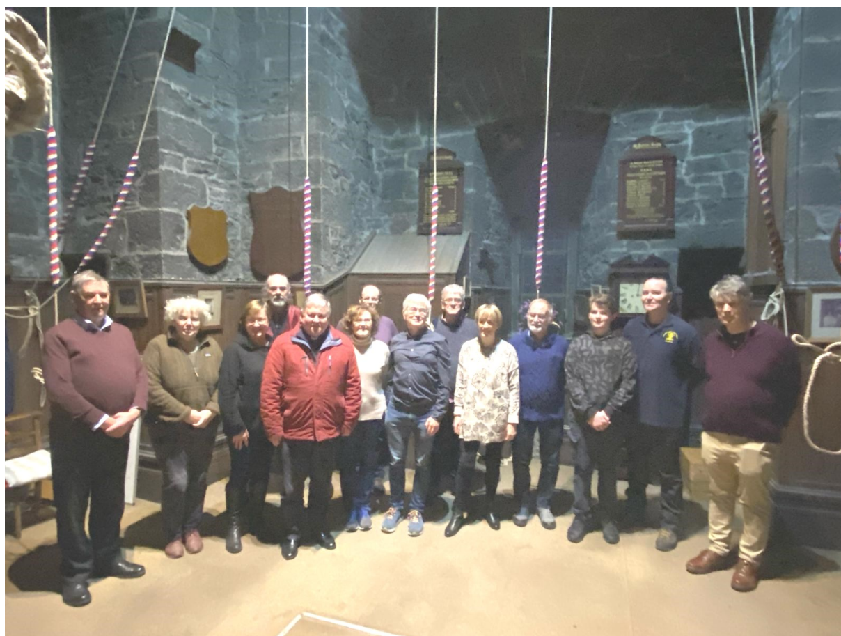
The Dean and bell-ringers on New Year's Eve