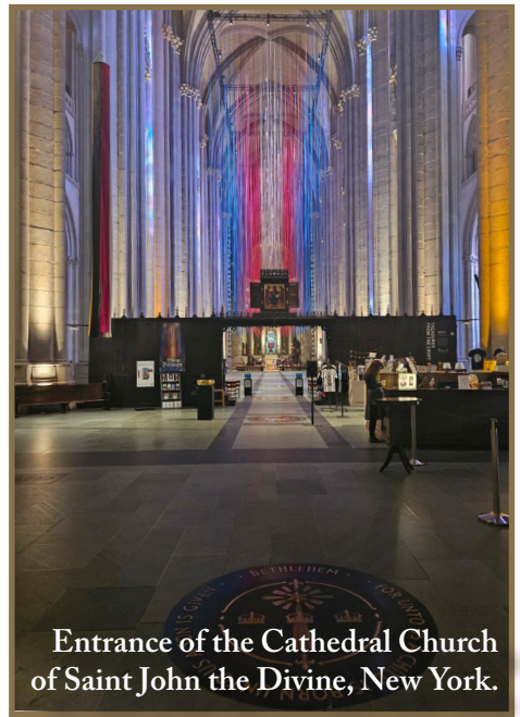
Entrance of the Cathedral Church of Saint John the Divine, New York.

More information about the trip to New York can be found on Page 12.