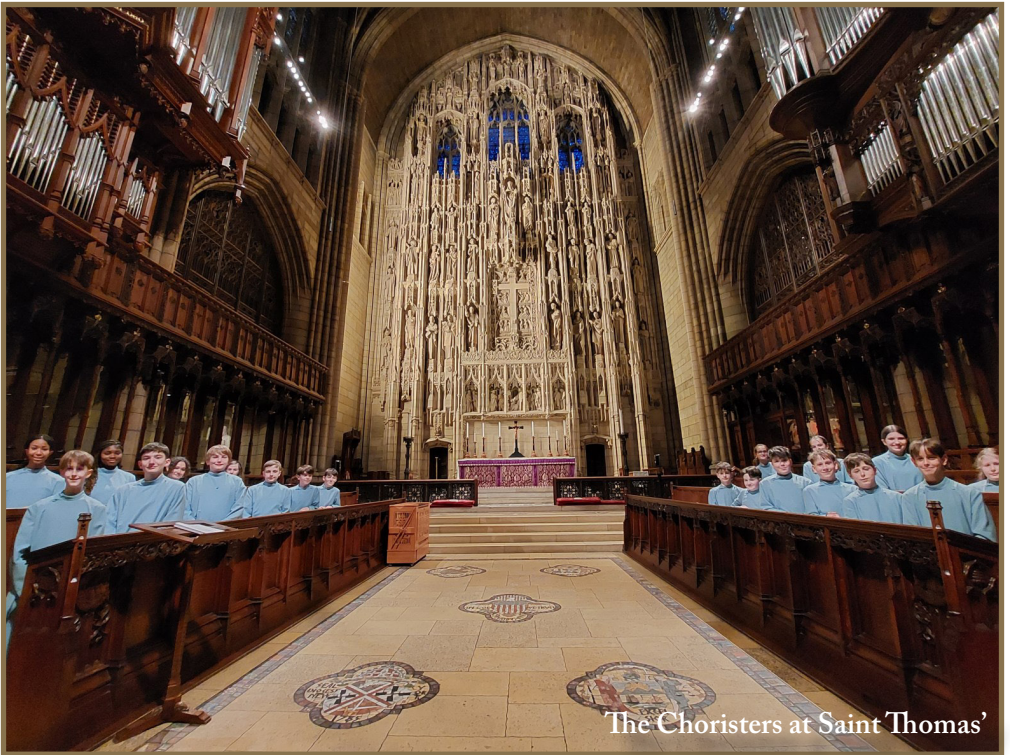
The Choristers at Saint Thomas'