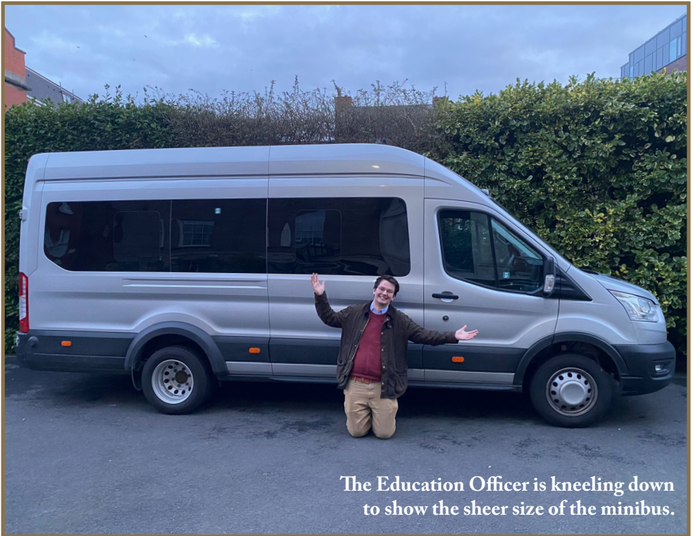
The Education Officer is kneeling down to show the sheer size of the minibus.