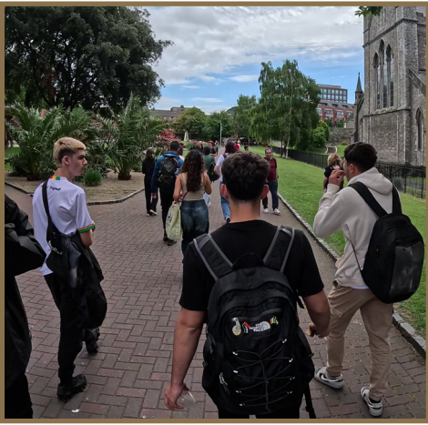
A day out in Patrick's Park.

Some adventurous souls even managed to take a dip in the Irish Sea... For Cypriots, their visit to Ireland was like their version of winter, so swimming in 'freezing cold waters' wasn't exactly on the agenda!