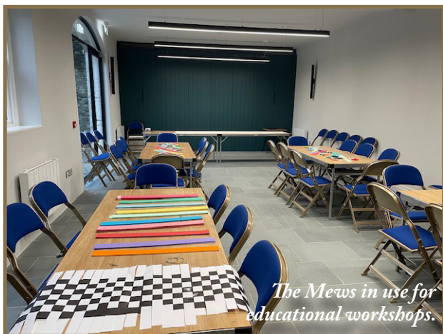
The Mews in use for educational workshops.

At ground-floor level, the refurbished building now offers a generous and flexible room, capable of seating up to