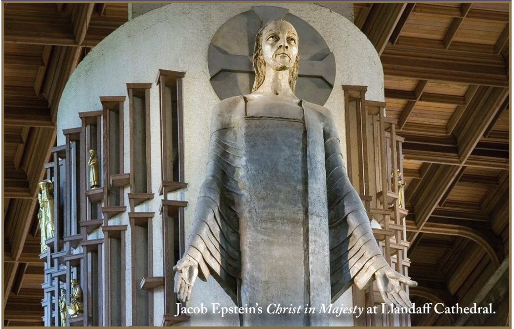
Jacob Epstein's Christ in Majesty at Llandaff Cathedral.

As Dietrich Bonhoeffer observed, only a suffering God can help. God does not stand apart from pain, but bears and transforms it from within.